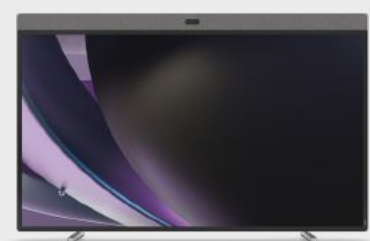
Neat Board Pro