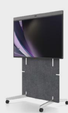
Neat Board Pro (with adaptive stand)