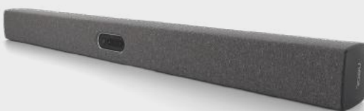
Neat Bar Pro