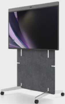
Neat Board Pro (with adaptive stand)