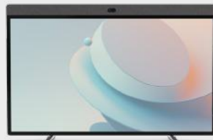
Neat Board 50