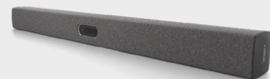
Neat Bar Pro