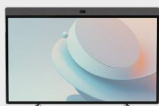
Neat Board 50