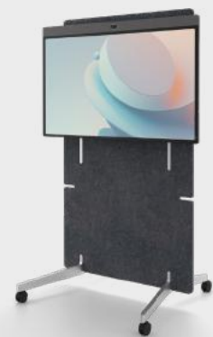
Neat Board 50 (with adaptive stand)