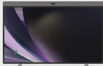
Neat Board Pro