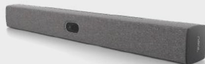
Neat Bar 2