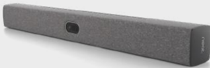
Neat Bar 2