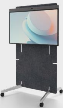
Neat Board 50 (with adaptive stand)