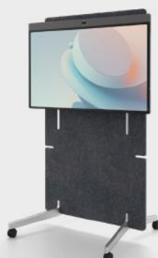
Neat Board 50 (with adaptive stand)