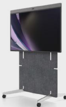
Neat Board Pro (with adaptive stand)